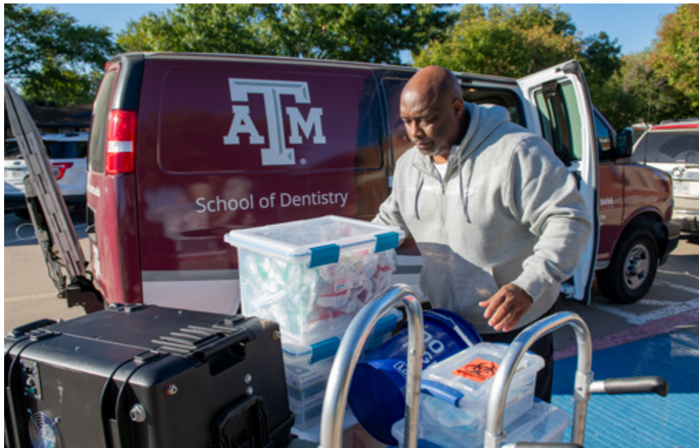
A Texas A&M College of Dentistry employee unloads supplies at an elementary school sealant clinic.

“Our students get to learn how to deliver care and how to give back to their community,” she said. “There is a great need in these two communities. It’s why Metrocrest Hospital Authority provided this money. They were very excited about the proposal.”