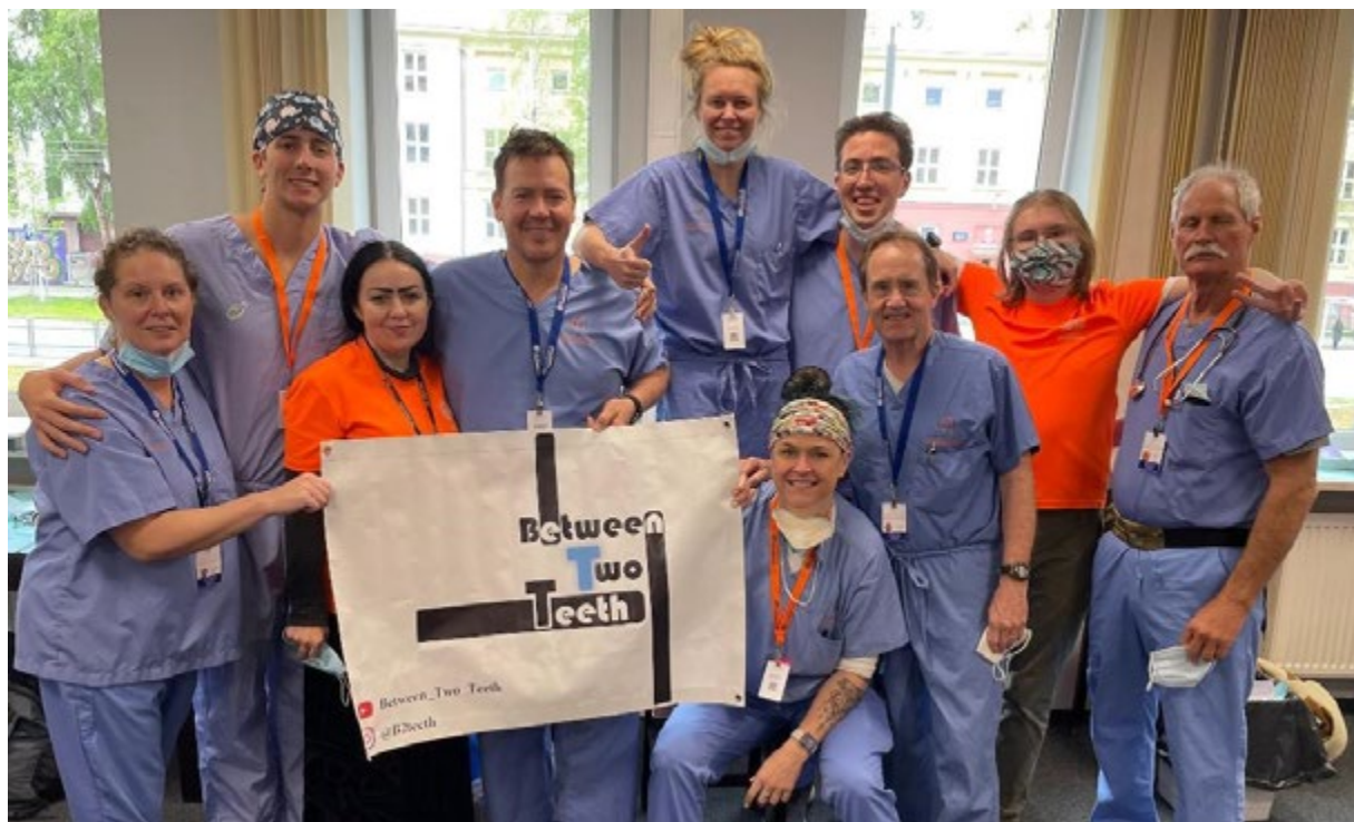
Right: The combined USA/ Ukraine team.