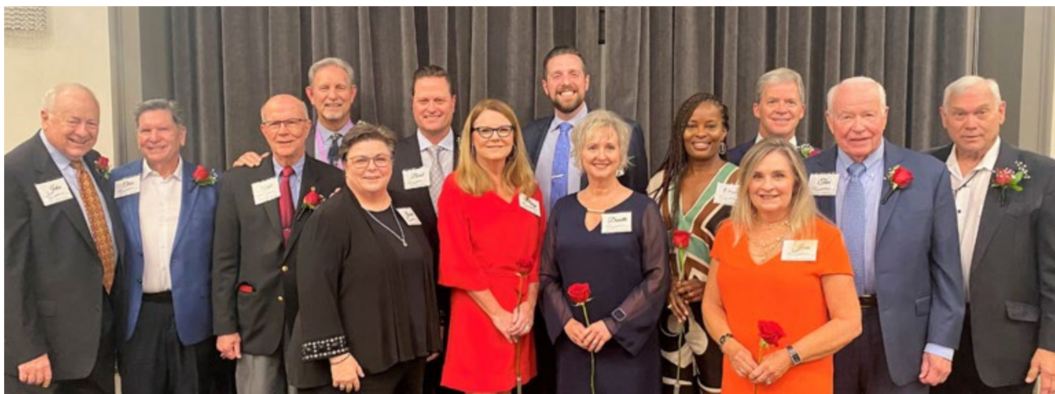
Past DCDS Presidents in Attendance